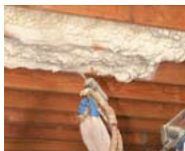
Floors over garages