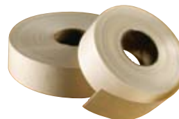
Spark-Perf ® Paper Tape