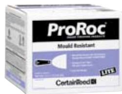
Mould Resistant Lite All-Purpose Ready-Mix Compound