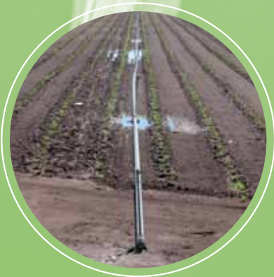
Aluminum system - puddling around leaking joints