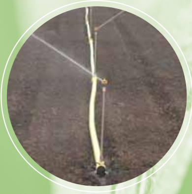
Certa-Set system - no leaking joints

The Certa-Set PVC piping system offers durability, flexibility and performance aluminum systems can't match. One of Certa-Set's best features is leakproof operation, which eliminates the puddling (and crop damage) that can plague aluminum systems.