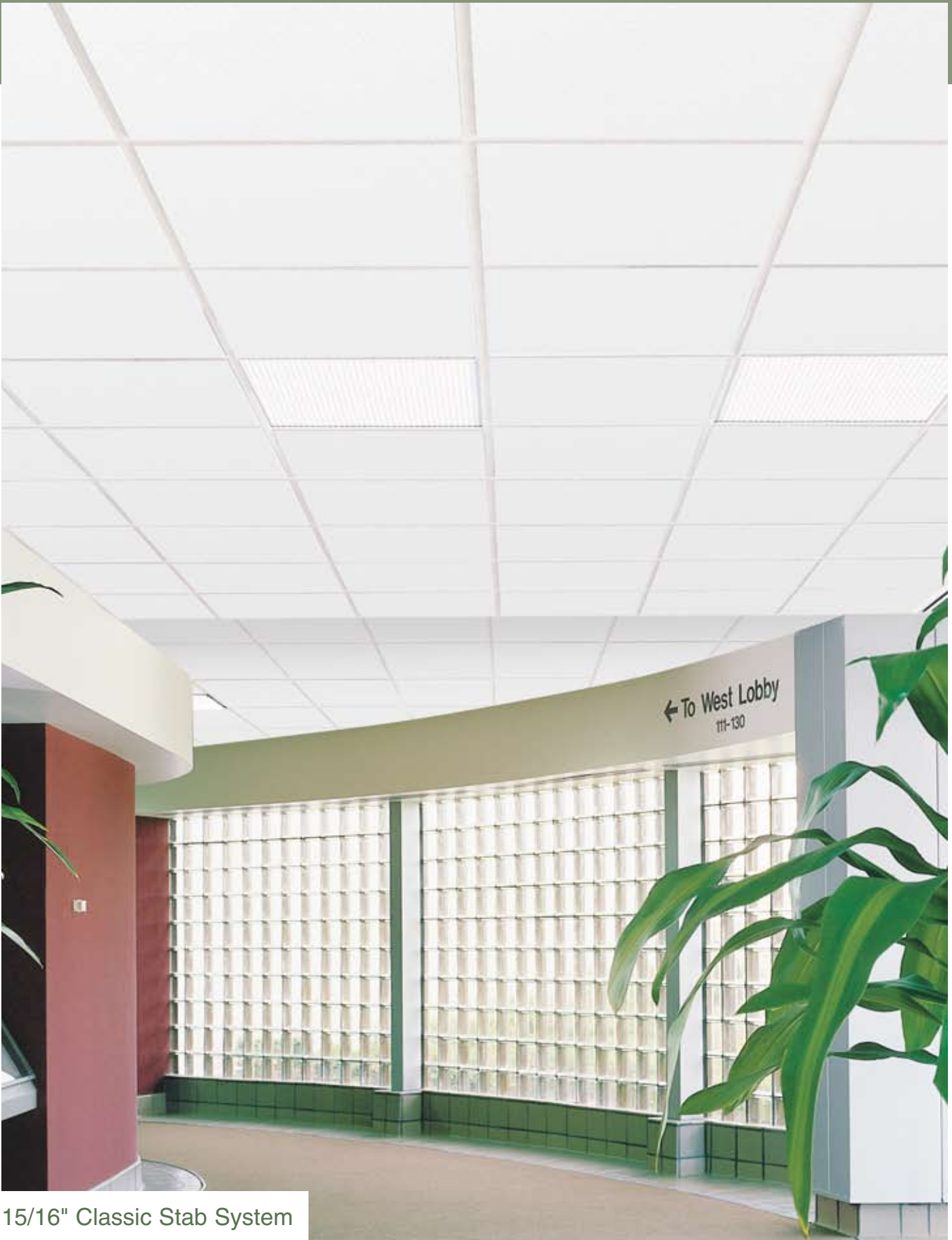
15/16" Classic Stab System