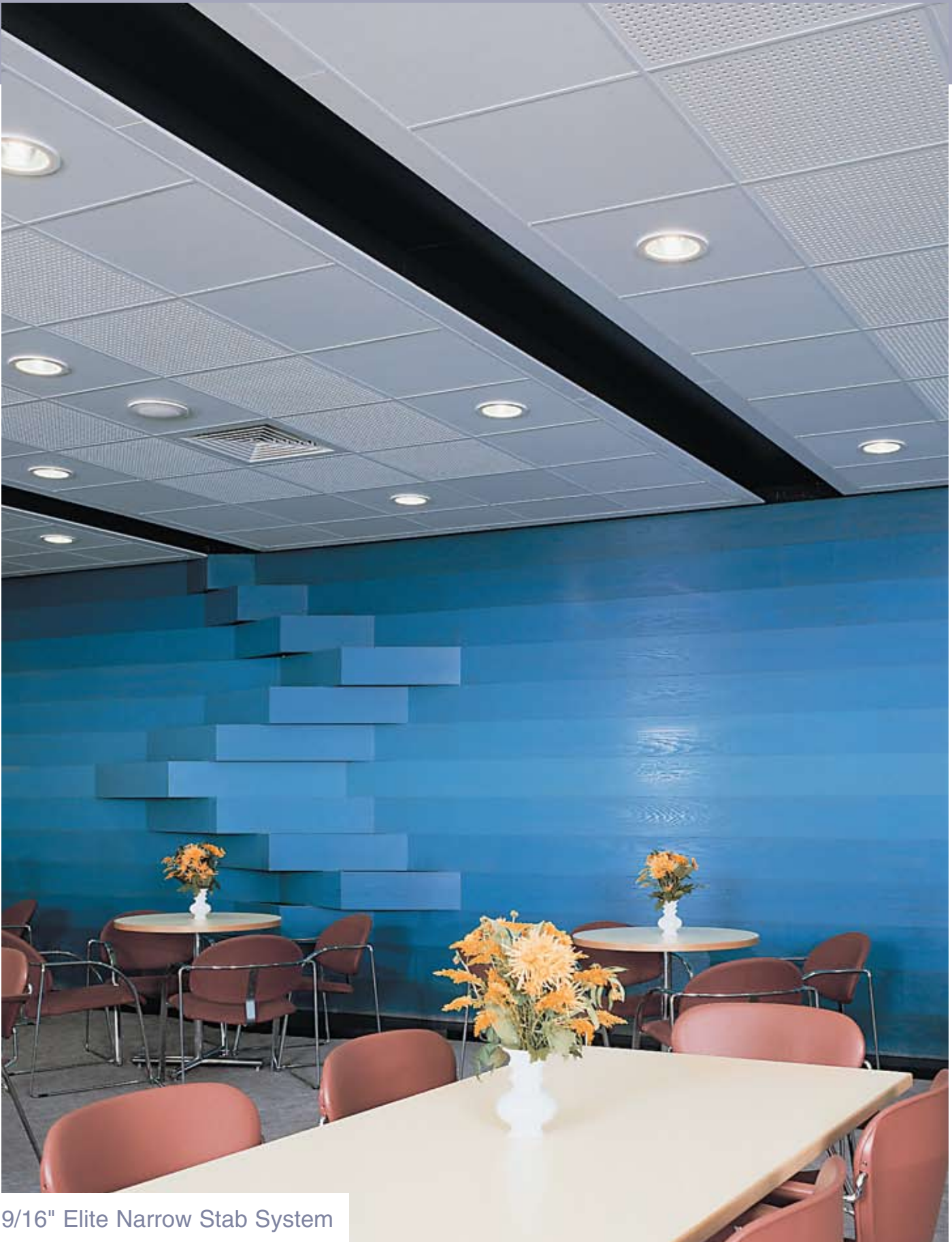
9/16" Elite Narrow Stab System