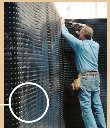
See reverse side.

Platon®, is a rugged, dimpled, high-density polyethylene (HDPE) membrane that keeps foundations and flooring dry. It's the “foundation protector” from CertainTeed, the world leader in building products and solutions.